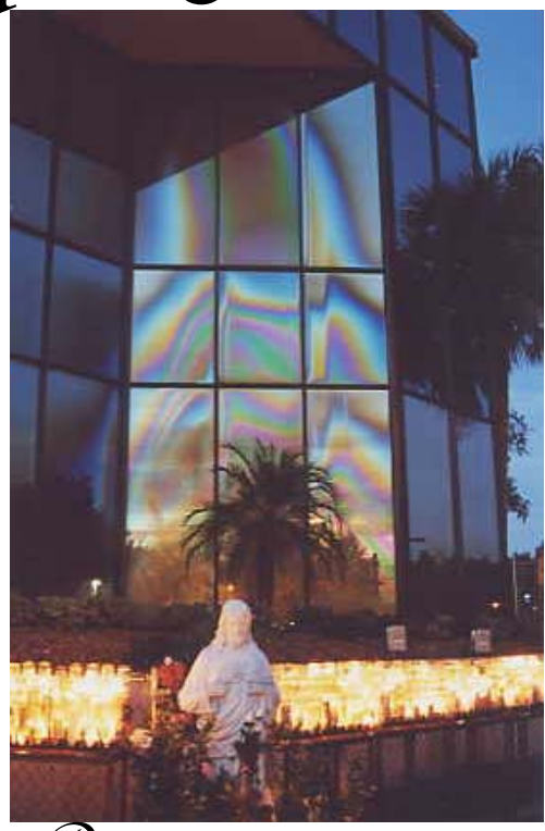
December 17, 2001 5 years since Mary appeared - Prayers 6:20 PM & Procession