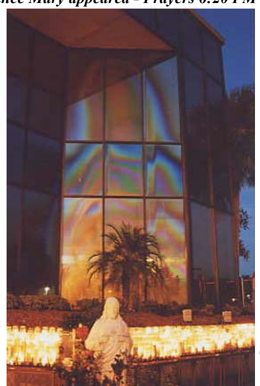
(Right next to each other #19 and #20 on the roll)