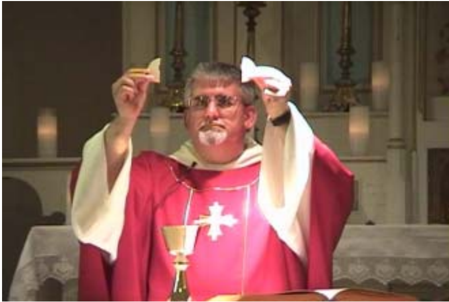
The Breaking of the Bread The Lamb of God