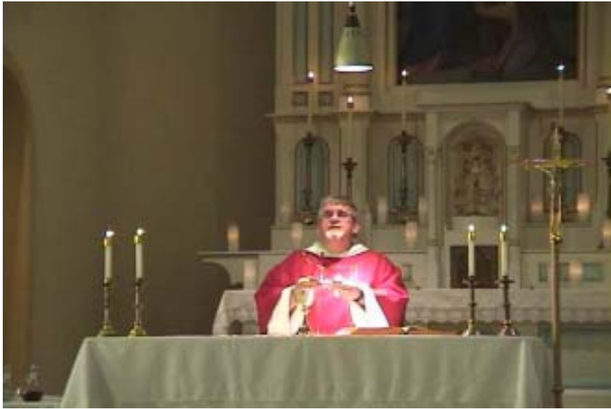
The Offering of the Bread