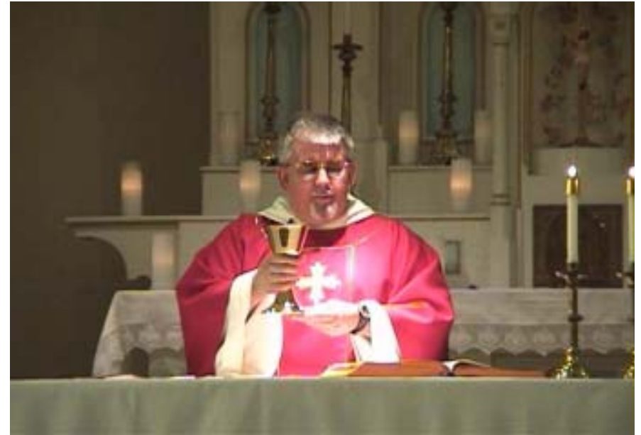
The Offering of the Wine