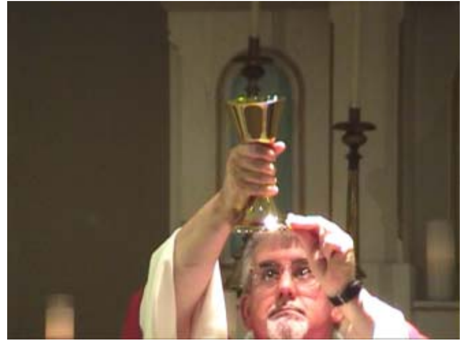
The Raising of the Precious Blood