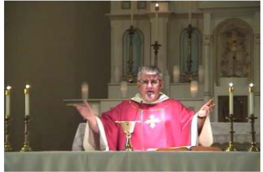
The Opening Prayer