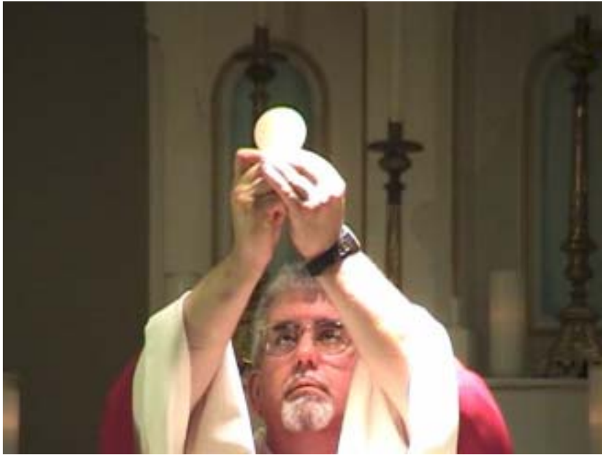
The Raising of the Consecrated Host